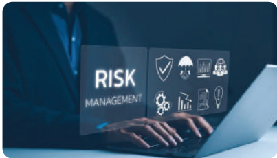
Risk Management Consultant