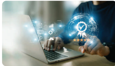
Collateral Management Analyst