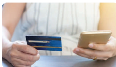
Clearing & Settlements Analyst