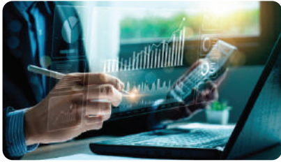
Investment Banking Associate