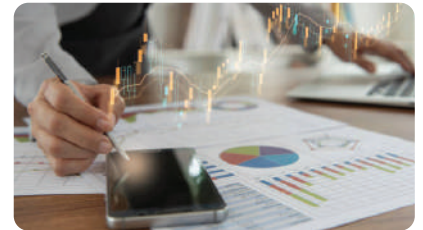
Hedge Fund Associate