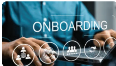
Client Onboarding Associate