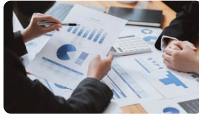
Wealth Management Associate